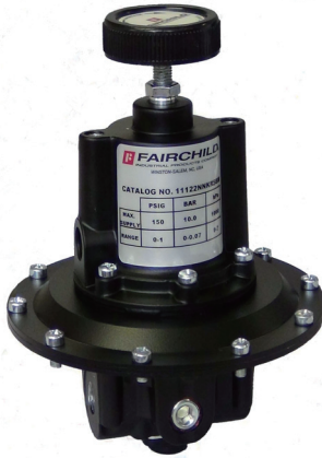
The Model 11 Pneumatic Precision Regulator is a regulator that precisely controls a set pressure.